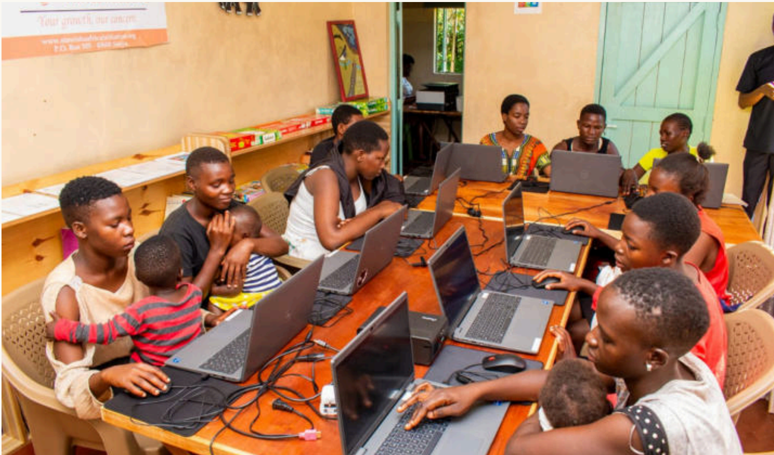
Computer class in session

Our physical library also received a boost with well-wishers supporting us to get books on cross-cutting topics. Our library is stocked with educational games that enhance holistic growth of young people.