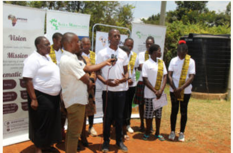
Media interview during the graduation