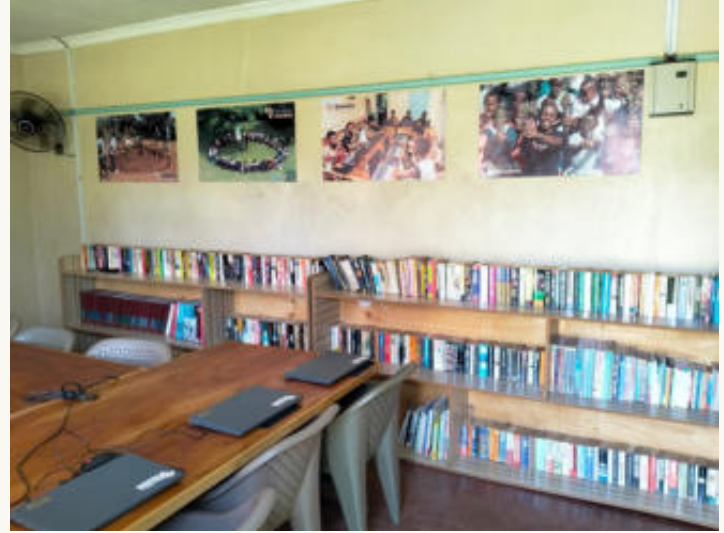
Book and computer library

Our physical library also received a boost with well-wishers supporting us to get books on cross-cutting topics. Our library is stocked with educational games that enhance holistic growth of young people.