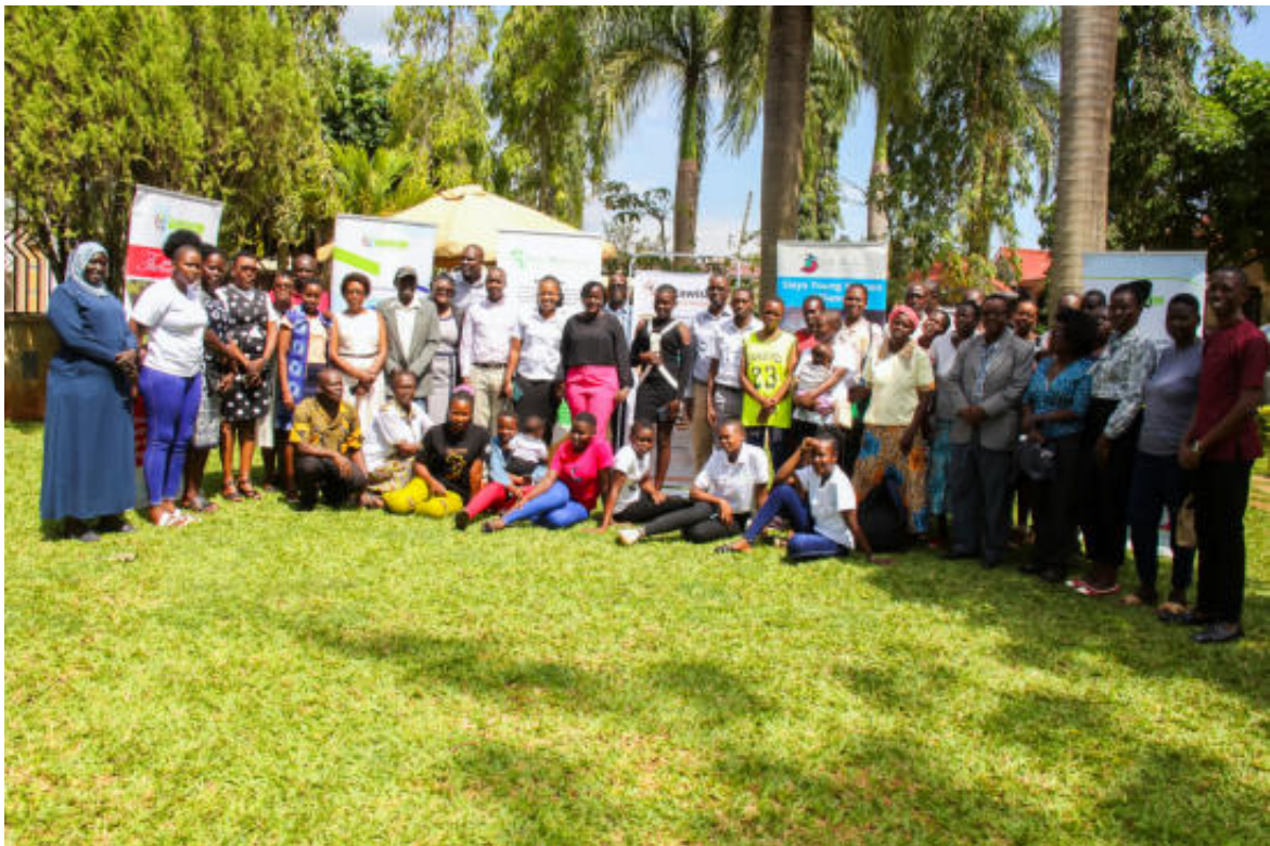
Project Launch, stakeholders group photo