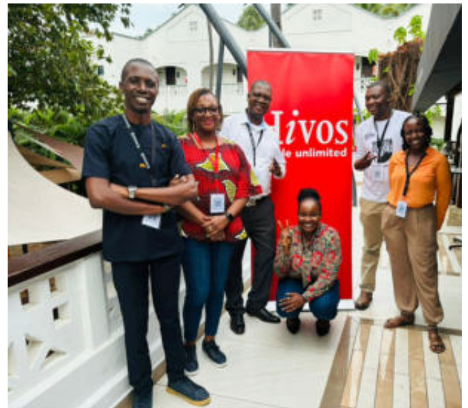
At the 7th Regional SRHR conference with partners and Hivos Management team in Mombasa Kenya