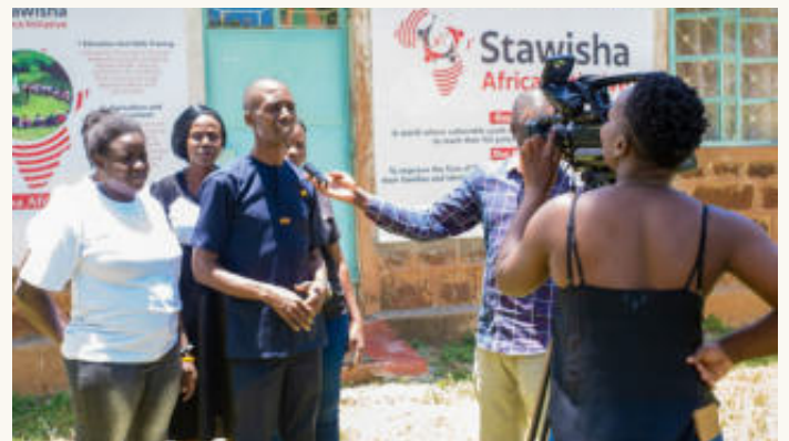
Above, media coverage during project launch

In March 2024 we launched Digital literacy project at Stawisha. The project is aimed at bridging the digital divide in rural Western Kenya, Siaya County. The project was made possible through the generous donation of our partners; Technology Without Borders Germany (TeoG). TeoG donated laptops and computer room furniture that the students will be using during the classes. Since project inception in March we have graduated 86 students, majority of these students have been young mothers who didn't get a chance to complete their schooling due to early pregnancy.