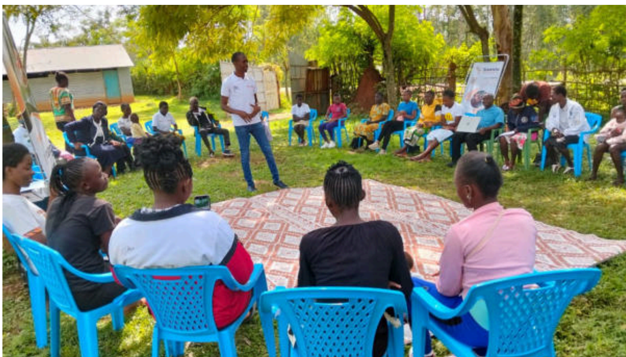
Intergenerational dialogue forum at Stawisha safe space

Young mothers taking part in the discussion during project launch.