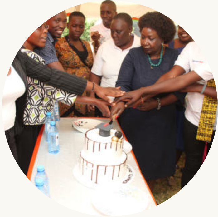
Cake cutting during Digital literacy Graduation, Stawisha trained 40 girls under this project